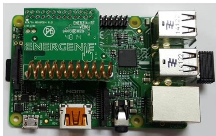
Figure 1 (Raspberry Pi B+ with RF Transceiver Board)