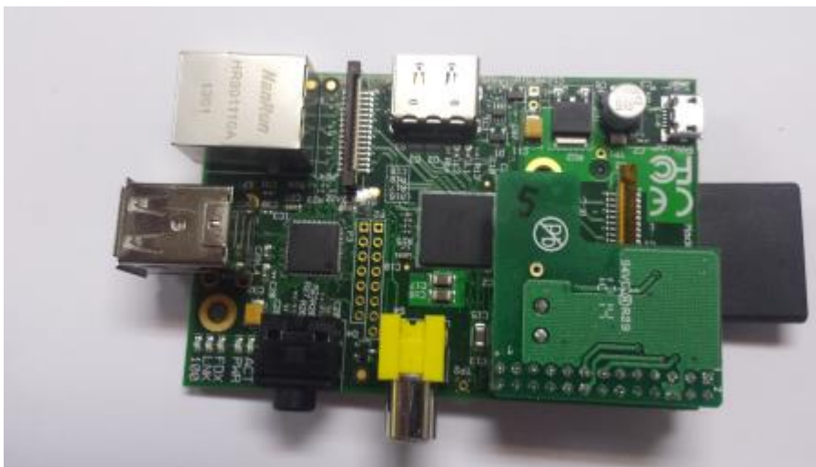
Fig. 1: R-Pi with piggy back RF-transmitter board

Install the board on to the row of pins as show in the picture and connect your Raspberry-Pi as normal to a monitor, mouse, keyboard and USB power supply.