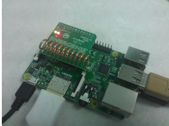
Figure 1 (Raspberry Pi B+ with RF Transceiver Board)

Install the board on to the row of pins as show in the picture and connect your Raspberry-Pi as normal to a monitor, mouse, keyboard and USB power supply.